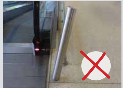
Traditional metal bollards do not absorb the impact.